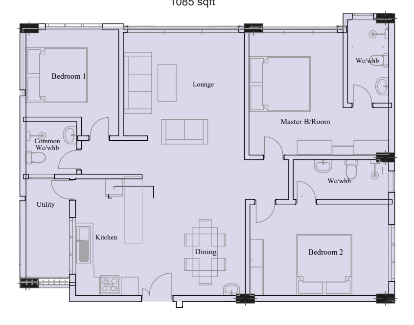
3 BR 1085 sqft